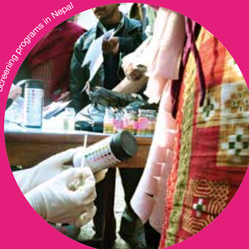
Screening programs in Nepal